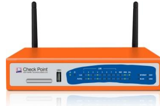
600 APPLIANCE (WI-FI OPTION)